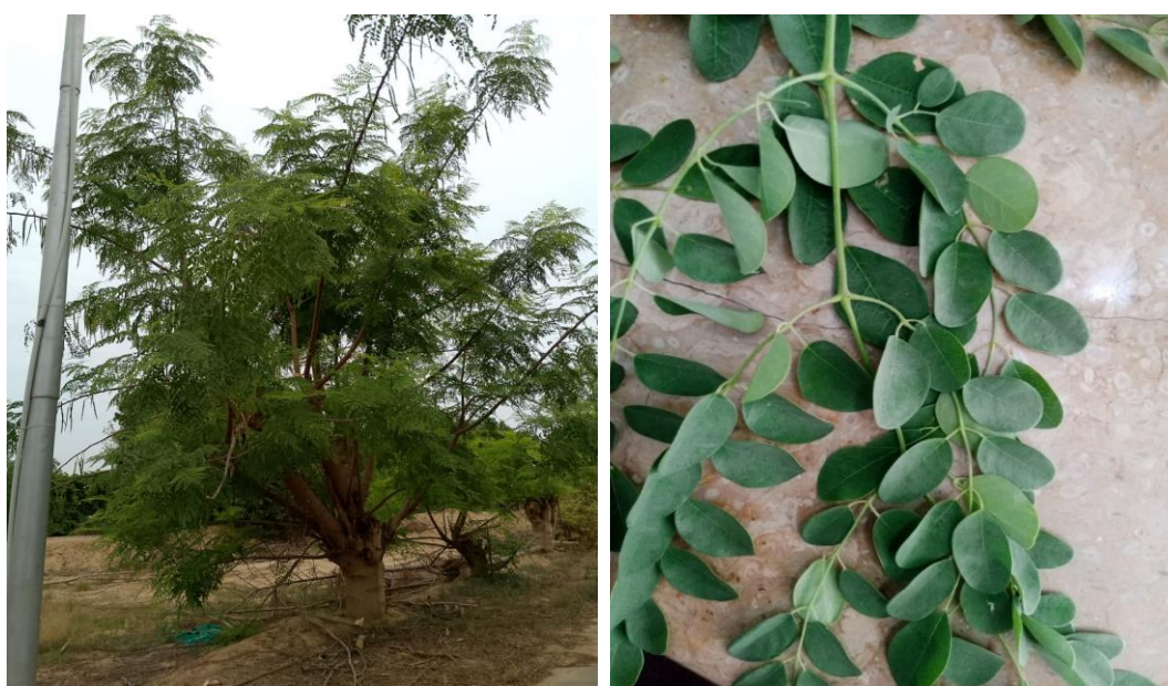
Figure 1. Moringa oleifera 's leaf and tree

Management techniques indicate that for seed production, a low-density triangular plantation with dimensions of 2.5 m × 2.5 m or 3 m × 3 m is needed; nevertheless, it also appears that 1.2 m along a row and 5 m between rows works well for adequate yields. Planting can be done in three different ways for leaf production: intensive (spacing 10 cm × 10 cm to 20 cm × 20 cm), semi-intensive (spacing 50 cm × 100 cm), or incorporated into an agroforestry system (spacing 1–4 m between rows). While commercial drip irrigation is advised to enable seed production during the dry season, moringa seeds may usually be sown during the rainy season and can germinate and develop without it. (Leone et al., 2016). Figure 1. Shows the Moringa oleifera 's tree.